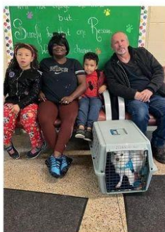
BELLA & BULLET