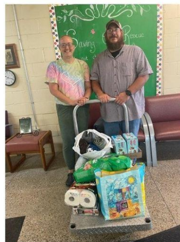
Amana Whirlpool donated all these helpful items in July!