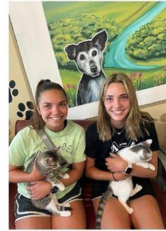
POLKA DOT & PIXIE