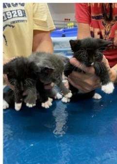
RAZZLE, DAZZLE, SPARKLE