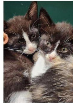
MUSTANG SALLY & HOT ROD LINCOLN