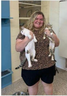
MR. PIFFLES & VELCRO