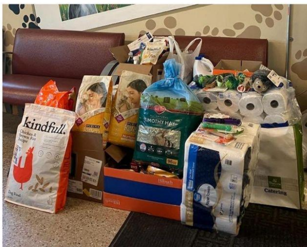
Shive Hattery Architecture and Engineering made a wonderful donation to Safe Haven in August!