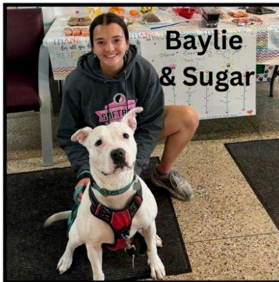
Baylie & Sugar