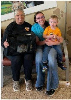
SAPPHIRE & AMETHYST