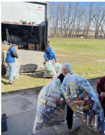
The Can Shed picking up nearly $500 worth of cans and bottles!