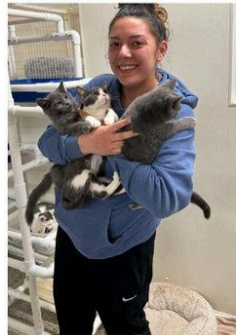
WAKKO, YAKKO, & DIAMOND